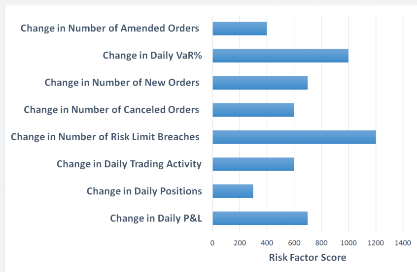
FIGURE 2: SAMPLE BEHAVIORAL FACTORS

Additionally, with a click of the mouse, firms using both Actimize's on-premises markets surveillance and Behavioral Analytics can view alerts generated by traditional analytics and the behavioral data associated with them together in RCM – our award winning case manager.