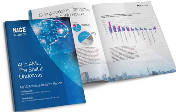
AI in AML: The Shift is Underway Insights Report

Interested in NICE Actimize AML solutions? Learn more here.