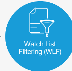
Watch List Filtering (WLF)

Enables end-to-end coverage for the detection, scoring, alerting, workflow processing and reporting suspicious activity