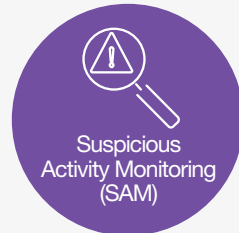
Suspicious Activity Monitoring (SAM)

Provides complete and consistent life cycle coverage for the KYC/CDD process