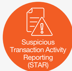
Suspicious Transaction Activity Reporting (STAR)

Screens customers, related parties and transactions