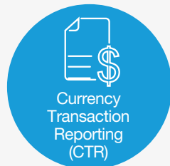
Currency Transaction Reporting (CTR)

Automates and optimizes processes for suspicious activity reporting to global jurisdictions, including e-filing